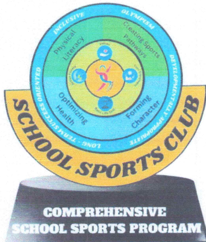
Figure 1: School Sports Club Conceptual Framework

The SSC program is framed within the Comprehensive School Sports Program. The framework for the SSC is integral in providing opportunities for learners to engage in fun and active physical fitness, as well as for them to learn basic life skills and values through various SSC activities.