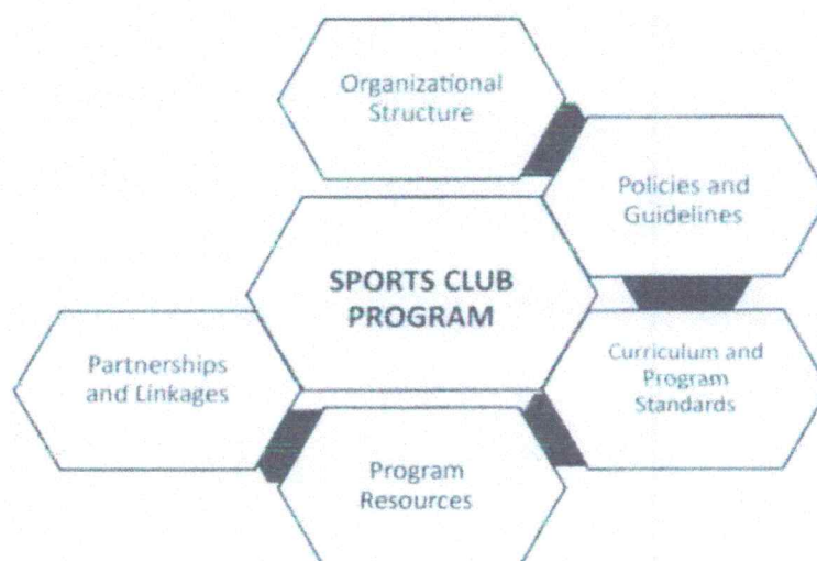
Figure 2: School Sports Club Management 4