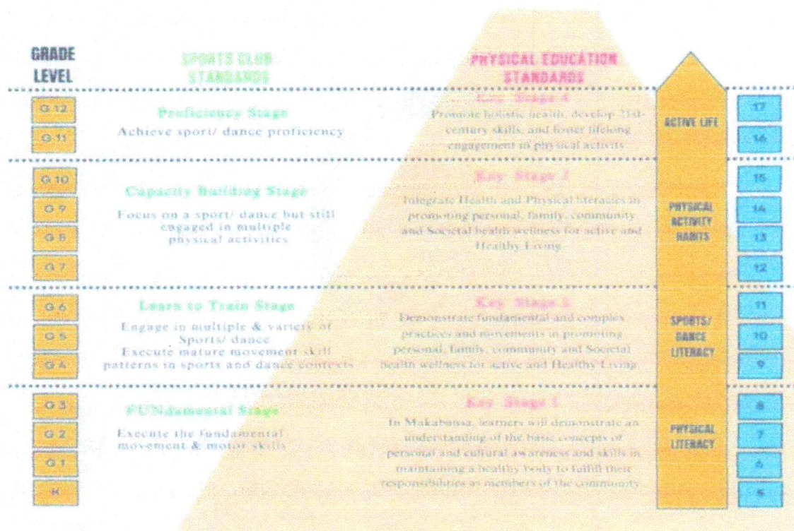
Figure 4 Illustrates how the SSC Standard supplements the motor skills and complements the current Philippine Curriculum "Physical Education Standards" whose main objective is to increase the physical activity of the learners.

At Key Stage 1, learners are introduced to fundamental movement and motor skills while developing personal and cultural awareness. This stage emphasizes the development of learners at their young age.