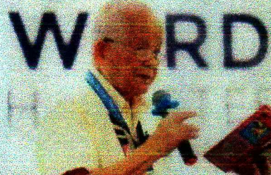
Write about climate change