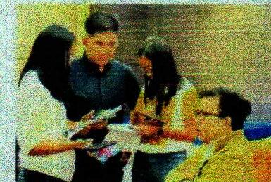
Learn what PH is doing vs. climate change

The global effects of climate change are already being felt. We need to take action now to prevent the worst effects of climate change.