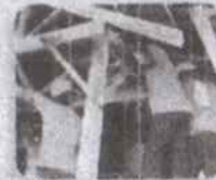
CARPENTRY NC II