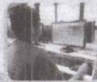
TECHNICAL DRAFTING NC II