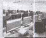
TECHNICAL DRAFTING NCII