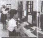
COMPUTER SYSTEM SERVICING NCII