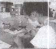
ELECTRONIC PRODUCT ASSEMBLY and SERVICING NCII