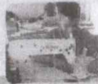
TAILORING NC II