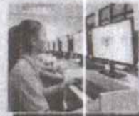
VISUAL GRAPHICS DESIGN NCIII