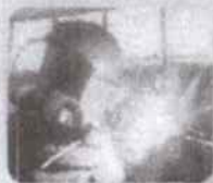
SHIELDED METAL ARC WELDING NC I & NC II