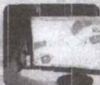
VISUAL GRAPHICS DESIGN NC III