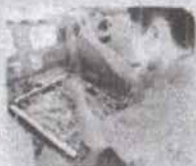
AUTOMOTIVE SERVICING NC II