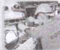
MECHATRONICS SERVICING NC III