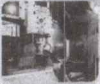
CNC MILLING & LATHE MACHINE OPERATION NC II