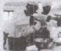
BREAD & PASTRY PRODUCTION NC II