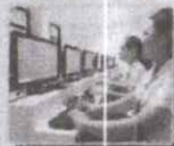
COMPUTER PROGRAMING (.NET TECHNOLOGY) NCIII