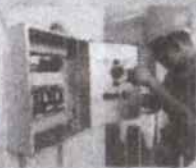
ELECTRICAL INSTALLATION & MAINTENANCE NC II & NC III