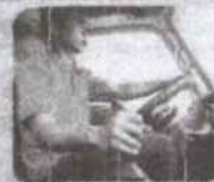
DRIVING NC II