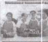
BREAD and PASTRY PRODUCTION NCII