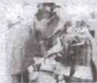
MACHINING NC I & NC II