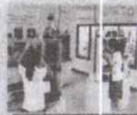
MECHATRONICS SERVICING NCII