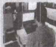
COMPUTER SYSTEM SERVICING NC II