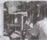
PLUMBING NC II